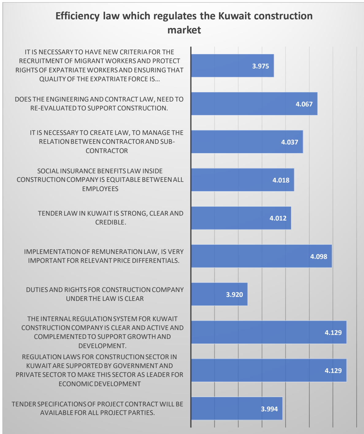
Figure 1 Efficiency law which regulates the Kuwait construction market (Mean)

Table 2 shows the descriptive statistics for participants' responses towards Conflict management strategy, by calculating Frequencies, Percentages, Mean, Standard deviation, and Rank.