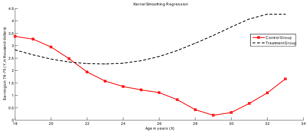
Figure 2: Nonparametric kernel estimates of the conditional means of changes in earnings between 1978 and 1975, as a function of age.