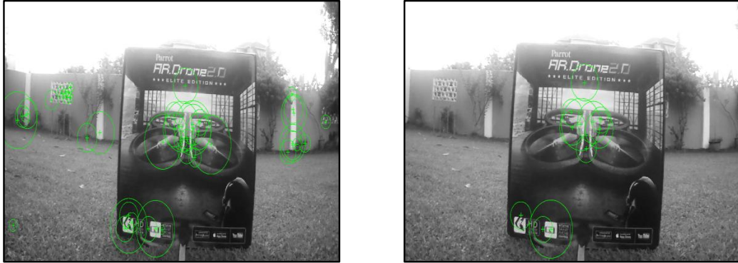
Figure 2: SURF keypoints features

We have conducted several experiments to determine the appropriate scale changes by varying the distance between RIF and TIF. For this experiment, TIF distance has been fixed to 4ft. This is due to the fact that, if the TIF distance keep increasing, then obstacle size or blob will be small in the image as compared to the surrounding. As a result, the SURF algorithm will produce a lot of keypoints to the background rather than to the obstacles itself. On the other hand, if the TIF distance is small enough, the avoidance planning by the UAV towards the obstacles will be a problem. These scale changes are the scales that are able to separate or distinguish the obstacles from background of an image.