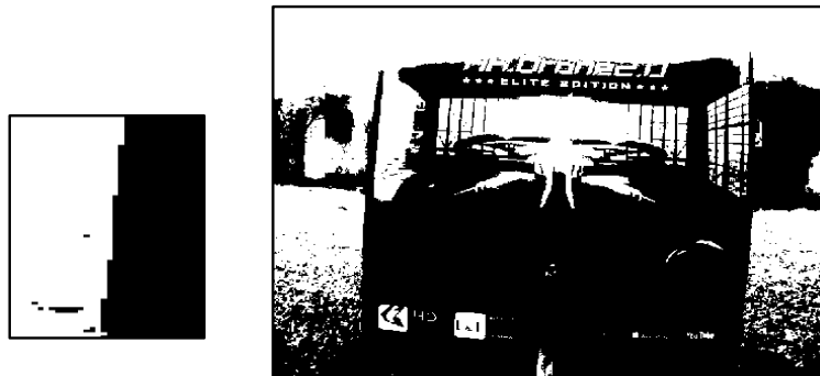
Figure 3: Corner step edge

The image frame in TIF is converted to binary from greyscale image. Binary image contain only 2 pixels value which are 0= white and 1=black, while greyscale pixels value is from 0 to 255. To performed this conversion we use luminace level of 0.5, which means any greyscale image pixels higher than 127.5 will replace into white otherwise black. Having performed this conversion, edge of the obstacle can be localized or transformed into many steps corner (see figure 3). We take this advantage to know the edge coordinate in the image by applying Harris corner detector.