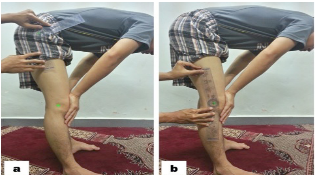
Figure 2. Bowing posture and measurement of the (a) hip and (b) knee joints at the end of the posture.