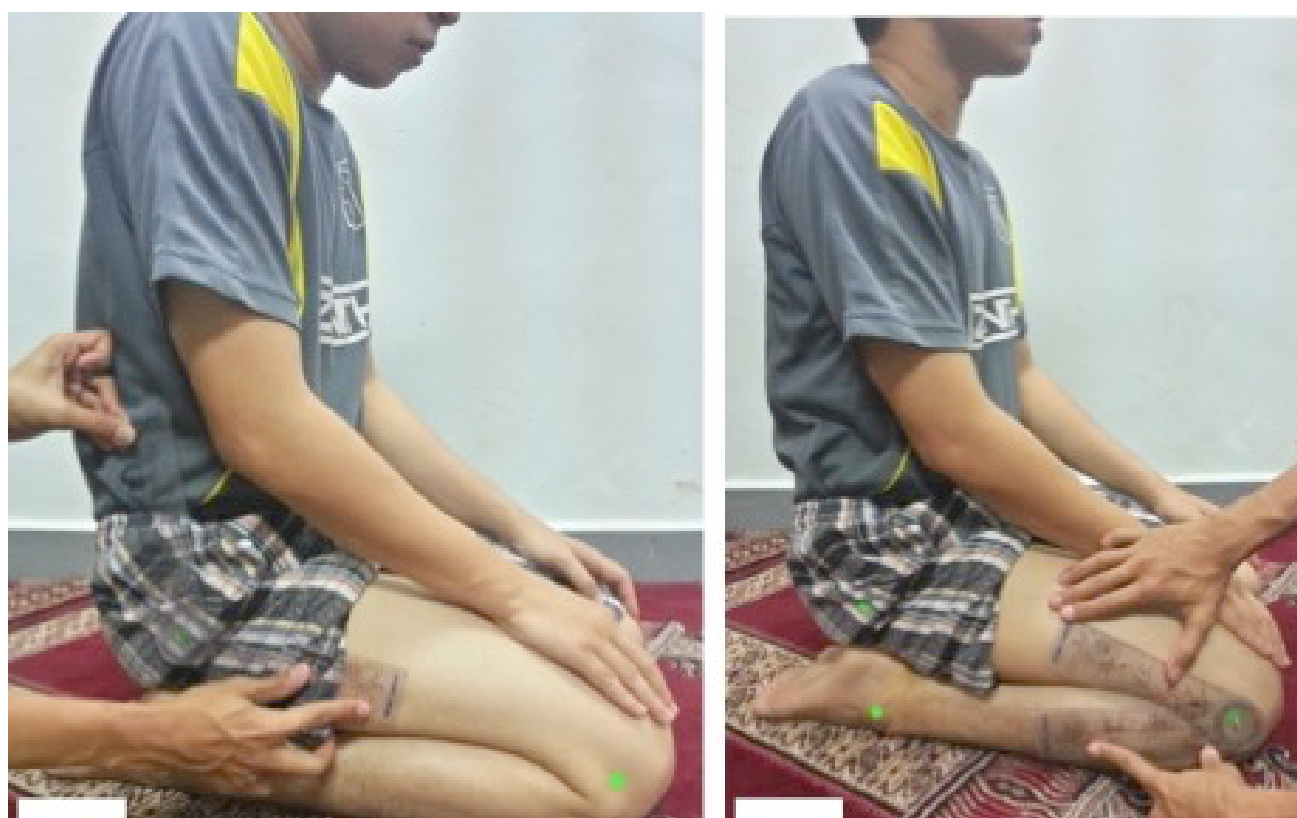
Figure 4. Sitting and measurement of the (a) hip and (b) knee joints at the end of the posture.