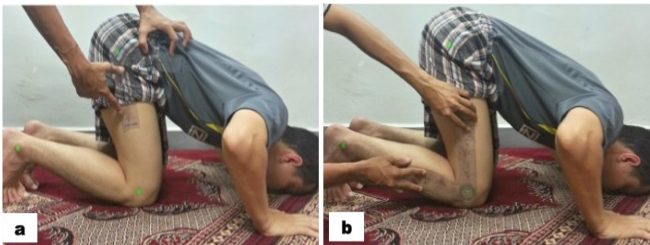
Figure 3. Prostration and measurement of the (a) hip and (b) knee joints at the end of the posture.