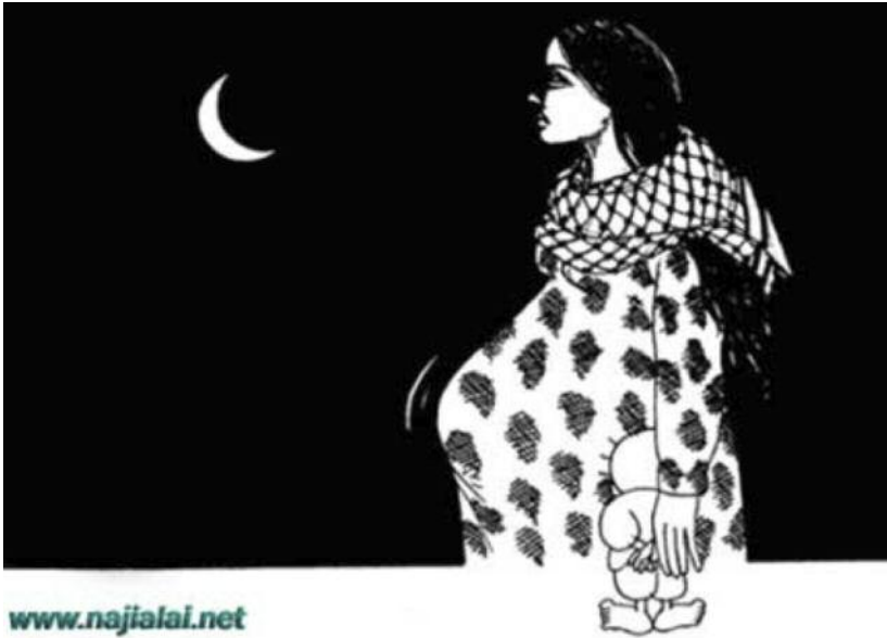
FIGURE 2 “Palestinian Woman” by Naji al-Ali

the key to the home that was taken from her family during the Nakba. Fatima is the land that was stolen and raped.