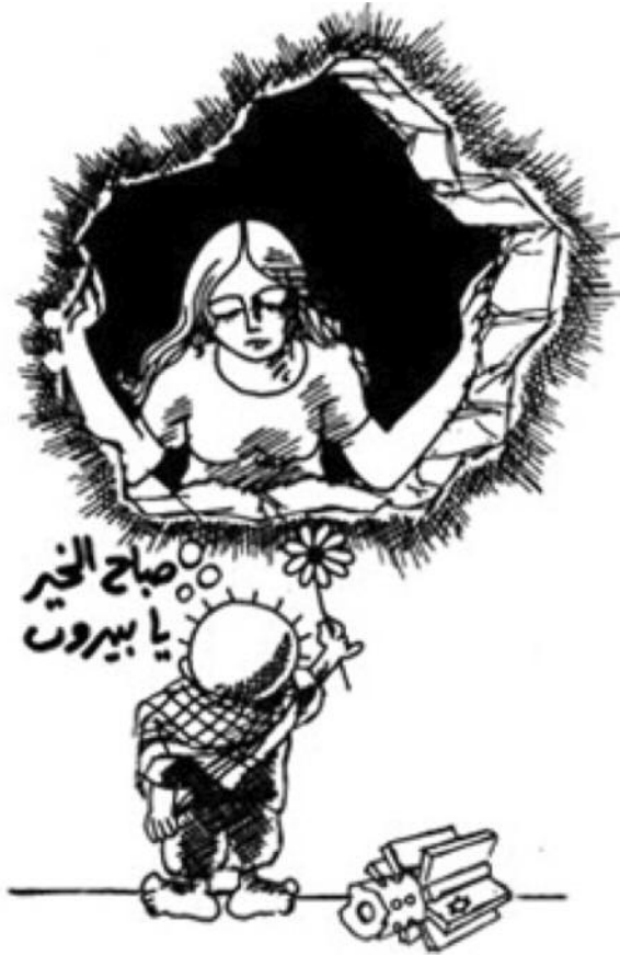
FIGURE 1 "Good Morning Beirut" by Najji al-Ali

Fatima is also the poor Palestinian mother who loses her son in the resistance, the oppressed, Ein el-Helweh refugee camp in Lebanon, the southern Lebanese woman, Egypt that refuses Camp David, Beirut that held the Palestinian fighters, a fighter in the war zones, and, lastly, the strong pole that survived the departure of Palestinian fighters from Lebanon in 1982 (el-Fakeeh 2011). She has strong anti-bourgeois views, debates Security Council Resolution 242, and mourns when the Israeli flag is raised in Cairo, all with sarcasm laced with some humour. She plants the seeds of hope, patience, resistance, and life. She is the positive and the nation's brain.