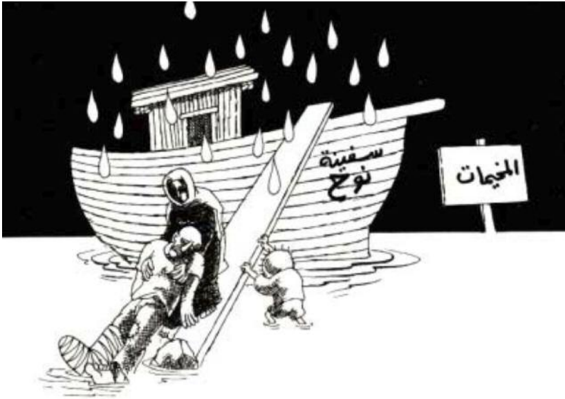
FIGURE 3 "Noah's Ark" by Naji al-Ali

join the resistance, and at times acts as the philosopher of the revolution. In some sense, Um Saad herself is the Palestinian revolution.