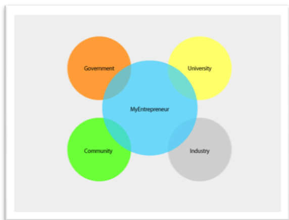
Fig. 2. Quadruple Helix Model (QHM) Concept in MyEntrepreneur2Cloud

using Quadruple Helix Model (QHM) in the project must be supported by the role played of the helices of Quadruple Helix Model (QHM) which are government, university, industry and community (see Figure 2).