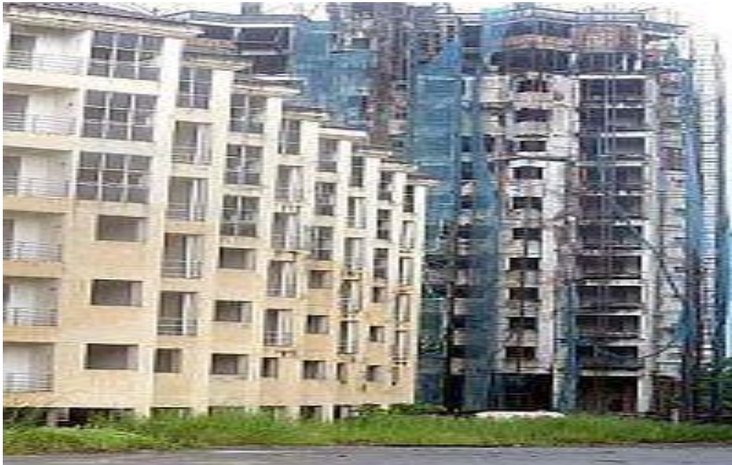
Figure 1: Condominium stands abandoned and dilapidated for more than 10 years in Sentul- East.

hinder the prospect of the city's socio-economic development. So far housing research in Malaysia is focussed on public or private low-cost with little attention paid to the growing condo sector. Therefore, a research need arises due to limited studies on the subject and further that due to more than one reason, Malaysian middle class city dwellers prefer to live in condos than their preferred terrace housing.