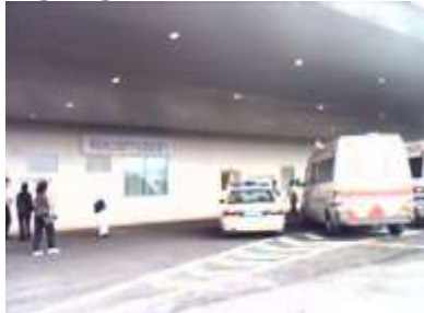
Fig. 7g Entrance, ED