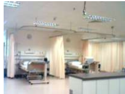
Fig.7e Observation Beds,ED