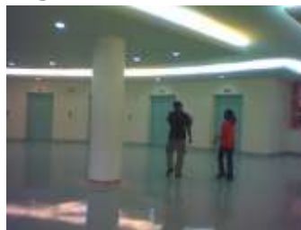
Fig 8e The make do waiting spaces at OT/ICU/HDW corridors