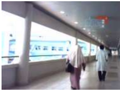
Fig.7a The Corridors