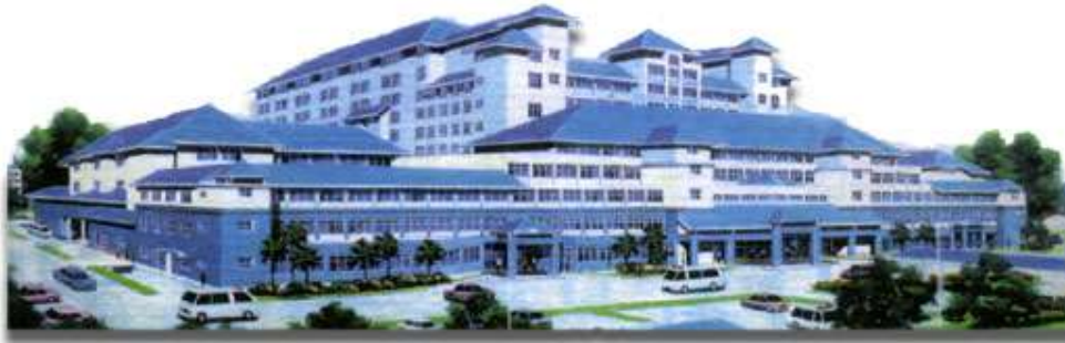
Fig. 5 Ampang Hospital, Kuala Lumpur (500 beds), Example of customized design hospital (internet)

object of focus, patients are never directly consulted in the planning nor design of the facility. Project briefs were prepared by ground staff and vetted by the MoH. Generally, apart from the written policy, the planning and design of the facility are derived from staff experiences of what the patients and service needs.