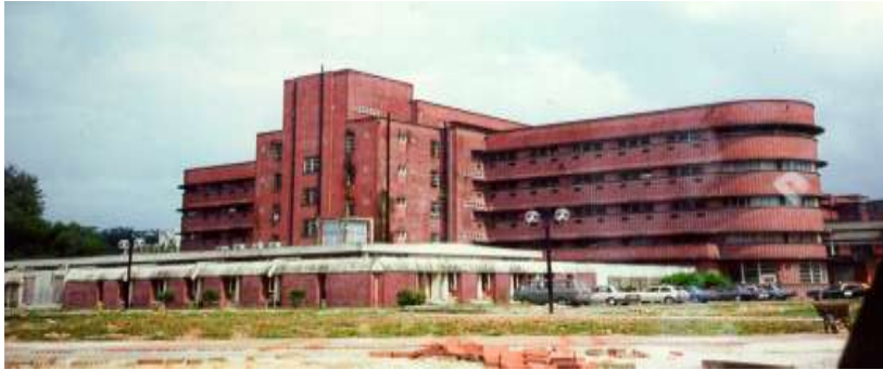
Fig. 2. Sultanah Aminah Hospital, Johor Bharu (1000 beds) high rise pre independent hospital architecture and a replica of Nankin Hospital in China

colonial masters and the people. The design and construction of these facilities denote the local culture of the people who loves to visit and stay with their relatives at any time in their daily routine to market. Pavilion structures (refer Fig. 3) with big verandahs as well as accessible in all directions from town were the common design trend of the time. Being in the tropics, climatic elements were seriously considered. The presence of long roof eaves for shade and shelter, ventilation blocks and timber slits for natural ventilation at high and low levels of the wall, huge casement windows with adjustable louveres for privacy and natural light had remained sustainable for many years. New sophisticated requirements for clinical procedures, equipping and the expansion of workload demand the change.