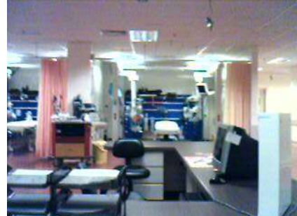
Fig. 7f Staff Base, ED