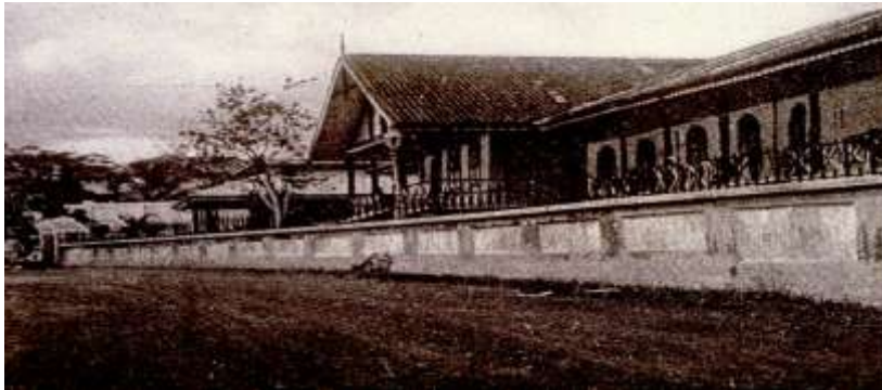
Fig. 3 Tanglin Hospital, Kuala Lumpur (now Health Clinic) Low rise - pre Independence hospital architecture.

After independence, rapid turnover on facility building to serve the people in all corners of the country were embarked. Process of designing these standard facilities (refer Fig. 4) was basic and rather utilitarian in nature. Although the semblance of pavilion type architecture was present, the operational policies had changed. The people had not changed. They still visit the sick at any time despite visiting hour roster and allowable numbers. The relatives still access the respective wards, if not through doors, they will communicate through windows.