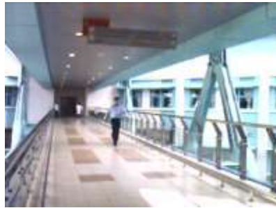
Fig. 7b The Linking Bridge