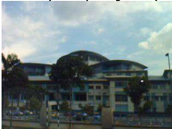
Fig. 7 Hospital Sg.Buloh (620 beds). Selangor. Located in Sg.Buloh about 12 Km from Kuala Lumpur Hospital