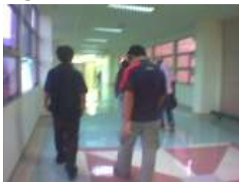
Fig. 8a The Corridor to the ward-long walk

Design Brief : Customised Design Development : Turnkey Construction : Turnkey Operational/In Use : In operation since 2000 Selected department : Circulation Area, Ward, ICU Date of Visit : June 2006 (Observation and interviews made during accompanying patient-late father)