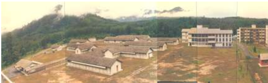
Fig. 4 Sik Hospital (100-150 beds) Example of post independence hospital architecture

After independence, rapid turnover on facility building to serve the people in all corners of the country were embarked. Process of designing these standard facilities (refer Fig. 4) was basic and rather utilitarian in nature. Although the semblance of pavilion type architecture was present, the operational policies had changed. The people had not changed. They still visit the sick at any time despite visiting hour roster and allowable numbers. The relatives still access the respective wards, if not through doors, they will communicate through windows.