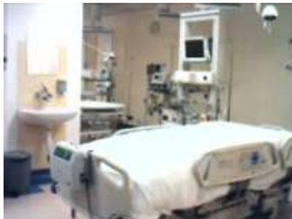
Fig 7d. Resus bay,ED