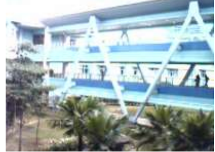
Fig. 7c The Garden Courtyard