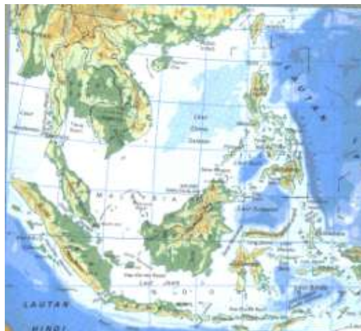
Fig. 1 Location of Malaysia in South East Asia.

Modern healthcare facilities especially hospitals are among the most expensive and complicated structure to plan, design, construct, commission, operate and sustain. Studies had shown that conventional implementation of a hospital may take 7-10 years from planning to operation. Once completed the up-keeping and maintaining the hospital to its original intention and purpose is again another uphill struggle all the way. Shortage of appropriate human resource, renewable energy, up scaling operational cost, unforeseen disease trends, emerging technologies, medical breakthrough, human migration and the varied culture of the users have impact on the facility. The surviving hospitals witnessed today are testimony to their ability to sustain various aspects of change to date. The future is yet unknown.