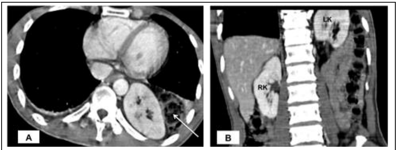
Fig. 2: Computed tomography of the abdomen. (A) Axial contrast-enhanced scan showed the left kidney and part of the bowel (arrow) within the thoracic cavity, in this image at the level of T10. (B) Coronal reformatted image showed higher location of left kidney (LK) compared to normal position of right kidney (RK).

Chest radiograph as initial and most commonly performed radiological imaging can demonstrate focal elevation of the diaphragm, especially if it was right-sided eventration 1 . Left-sided focal eventration is more difficult to be assessed on chest radiograph due to overlying cardiac shadow 3 . Occasionally, it demonstrated an opacity mimicking a mass lesion as in this case. Further assessment can be done with CT and reformatted images can delineate the diaphragmatic outline better 4 . Ectopic kidneys can be evaluated with excretory urography and ultrasonography 3 . Magnetic resonance imaging can be helpful but is not feasible in acute trauma cases.