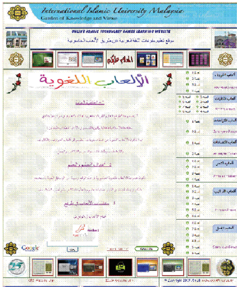
Figure 3. Pre-prototype of an online Arabic vocabulary game