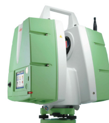
Figure 2 Terrestrial laser scanner Leica ScanStation P20

Indirect georeferencing was done in Cyclone by registering scans from stations 5 and p2 using identical control network points (points 1-4). The mean absolute error of the performed registration was 2.1 mm. The resulting georeferenced point cloud contained a lot of points which represented objects of no interest in this particular case, so "cleaning" of the point cloud was required. Afterwards, this reduced georeferenced point cloud was unified, i.e. the point cloud was resampled with point spacing set to 5 cm. The final point cloud used in the further analysis consisted of a little more than 3 million points.