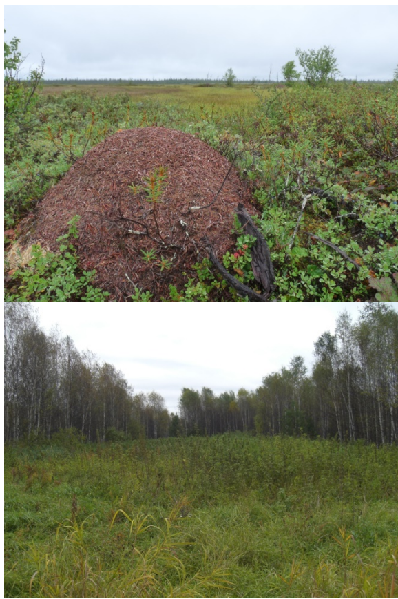
Figure 2: Peatlands in the Southern Taiga a) Natural bog with anthill of Formica spec. . These ants are very important for biological preventing of insect calamities. b) Cultivated and abandoned peatland

due to drainage and agriculture in a temperate warm and subhumid climate (Drösler et al 2008, Mueller et al 2008).