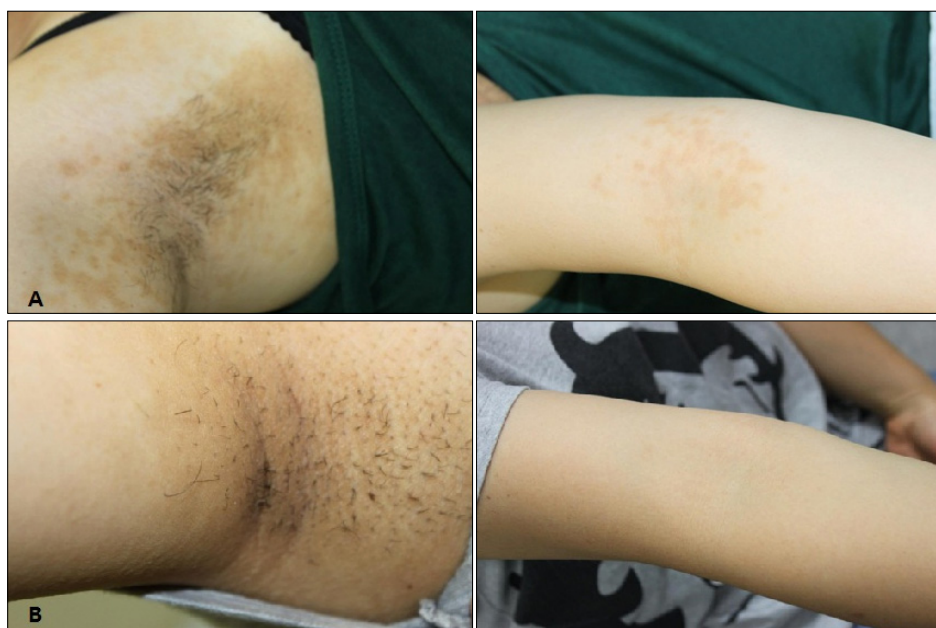
Fig. 1. (A) Hyperpigmented scaly macules with a reticular pattern on the axilla and antecubital fossa. (B) Complete resolution of the skin lesions after 2 months of doxycycline treatment.