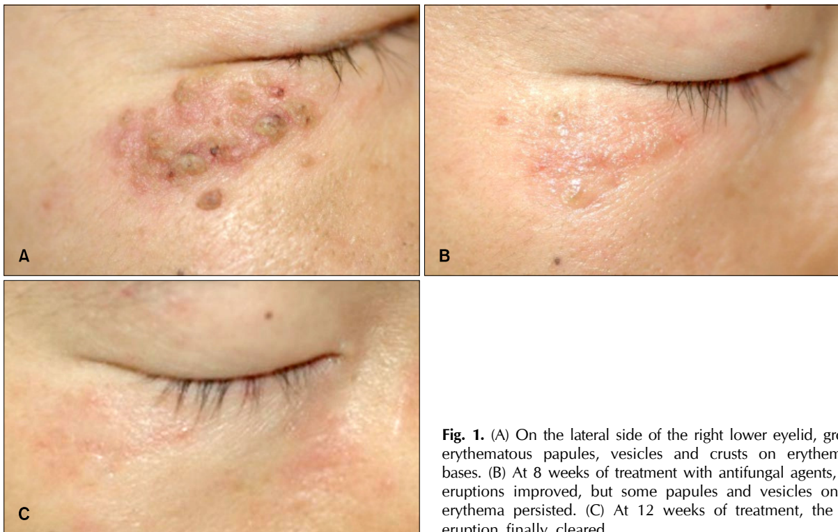
Fig. 1. (A) On the lateral side of the right lower eyelid, grouped erythematous papules, vesicles and crusts on erythematous bases. (B) At 8 weeks of treatment with antifungal agents, facial eruptions improved, but some papules and vesicles on mild erythema persisted. (C) At 12 weeks of treatment, the facial eruption finally cleared.