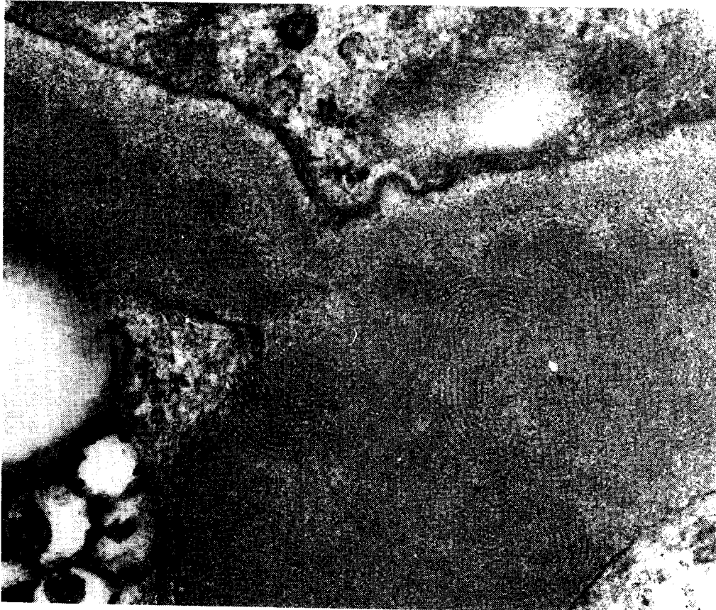
Fig. 3. Same glomerulus as in Figure 2 showing bundles of curved electron-dense bands with fingerprint patterns. EM (x39,000).