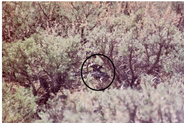
Figure 3. A radio-marked sage-grouse nest in a sagebrush stand with high canopy cover, typical of nesting habitat in Utah. The female was incubating and her head and back can be seen in the black circle.

Lastly, we used percentiles to establish minimum values; i.e., guidelines, for each habitat characteristic (e.g., shrub cover, grass height, forb cover, etc.). For example, to explain percentiles, if we measured the height of 100 sagebrush plants which had minimum and