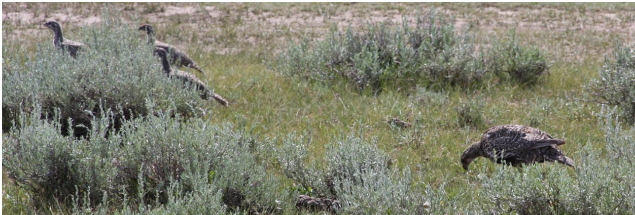
Figure 1. Sage-grouse brood female and chicks feeding in a late brood-rearing area, with lower sagebrush canopy cover, typical of habitat selection during the summer.