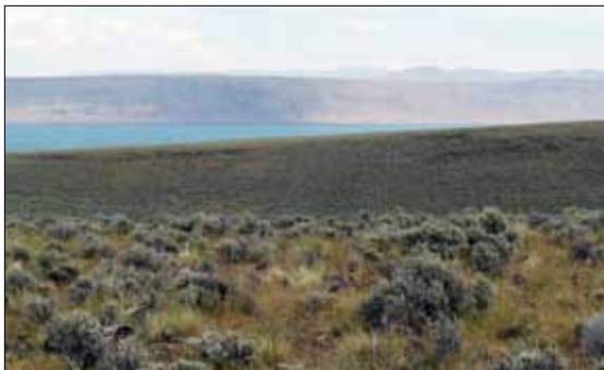
Healthy sagebrush steppe habitat.