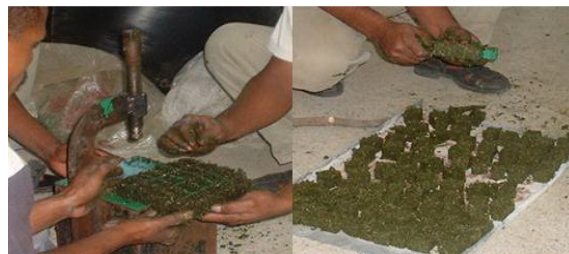
Figure.1 Producing Cubes Manually.

manually filled and placed in the sun to dry. Drying took from 2-3 days depending on the strength of the sun. Using this method, farmers could make cubes per day. Each cube was approximately 3x3x3 cm 3 in size and weighed 15 g. This manual method can still be improved. Changes suggested are an increase in the number of cubes produced per mould as well as the number of moulds available to the farmers. This would allow cube production to be increased and would be beneficial for villages where it would be difficult for low income farmers to obtain machines and equipment.