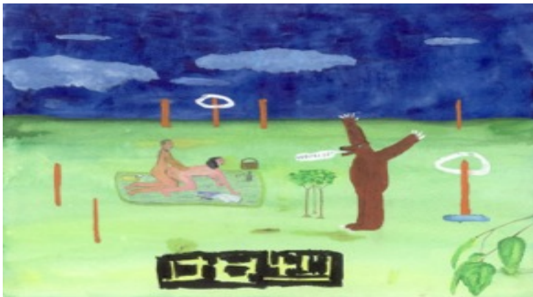
Fig. 13 The Meme "Hello, bear!" with Dmitrii Medvedev. See http://netspider.com.ua/index.php/2008/03/02/preved-medved/