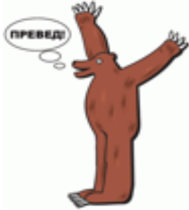
Fig. 12 "Bear surprise" by John Lurie. http://www.johnlurieart.com/art/index.php?s=prints