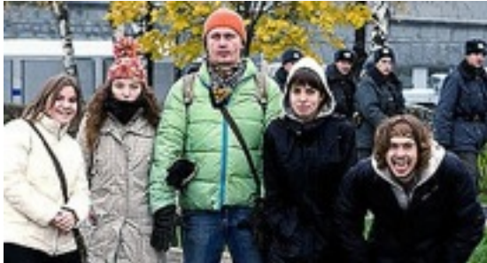
Fig. 3 Action “Palace Revolution” 16 September 2010, Saint Petersburg. See: http://plucer.livejournal.com/tag/Дворцовый%20переворот . See video: https://www.youtube.com/watch?v=Ue_Wd2AjKAI