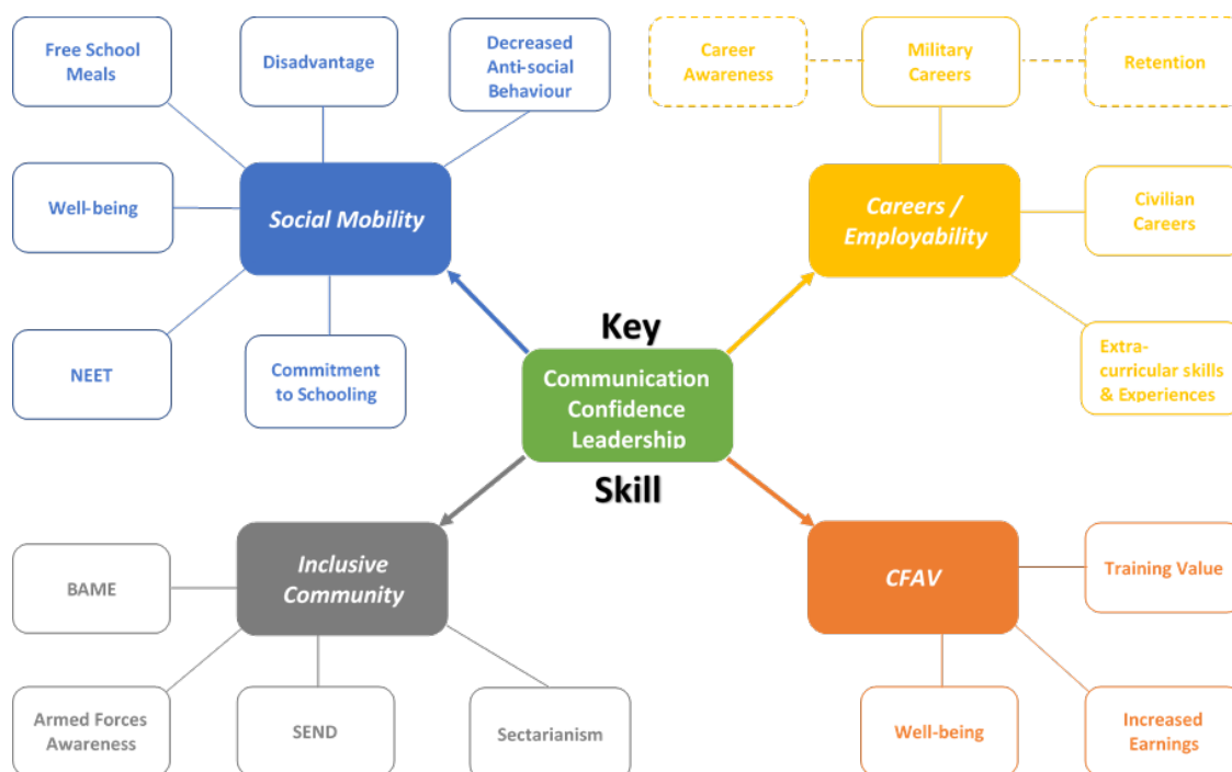
Figure 2 - The different areas of social impact that emerged from the primary data collection