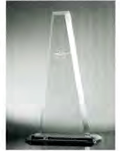
The Janet C. Hindson Award