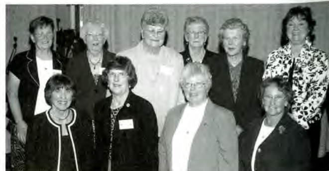
Central PA Satellite