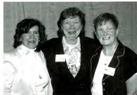
Current and Past Presidents

The Bulletin is published annually by: Jefferson Nurses' Alumni Association Thomas Jefferson University Hospital 130 South 9th Street, Suite 724 Philadelphia, PA 19107-5233