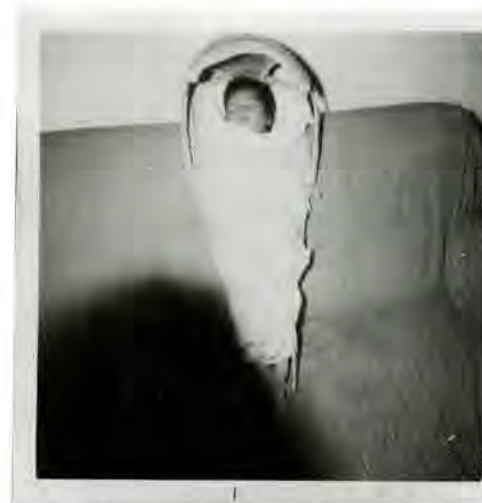
Sells – A little Papago papoose.