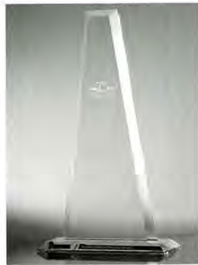
The Janet C. Hindson Award