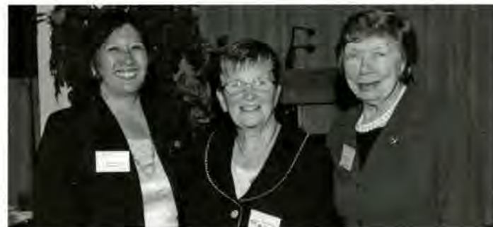
Current and Past Presidents