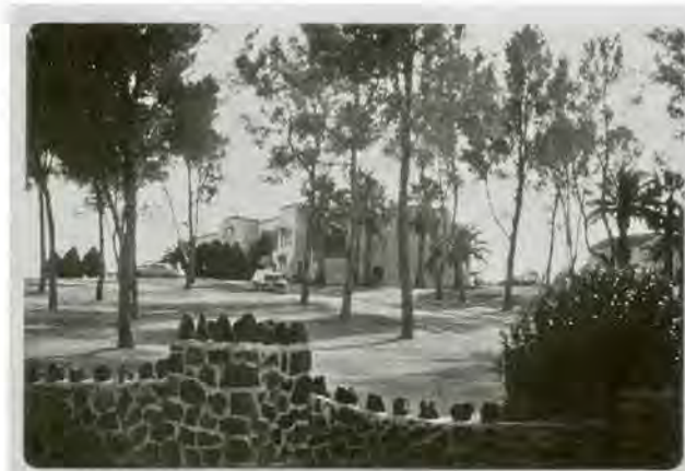
San Xavier – Indian Health Service's Health Program Systems Center. There was a clinic for Papagos here, I had one of my offices here as did the computer experts also.

At the time I was employed, the Papagos, also known as the Desert People, numbered about 7,500, and lived in small, widely scattered villages throughout the reservations. Many lived at a bare subsistence level and had few amenities. Life for most, was not easy as resources were scant. English was a problem for many. They suffered from all the usual White Man's diseases but, like their cousins the Pima, had a higher than expected incidence of diabetes. A multidisciplinary approach to assist the Papagos in improving their lot in life was initiated by the HIS and the PHN staff played an important role in this endeavor as did the Papago Tribal Health Committee.