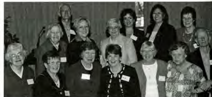
Board Members and Volunteers