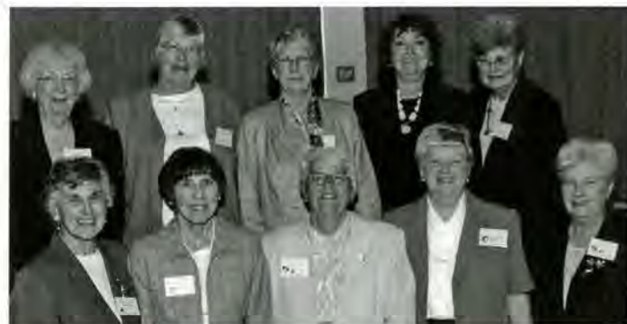
Central PA Satellite