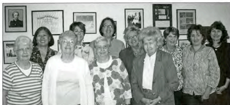
Board of Directors