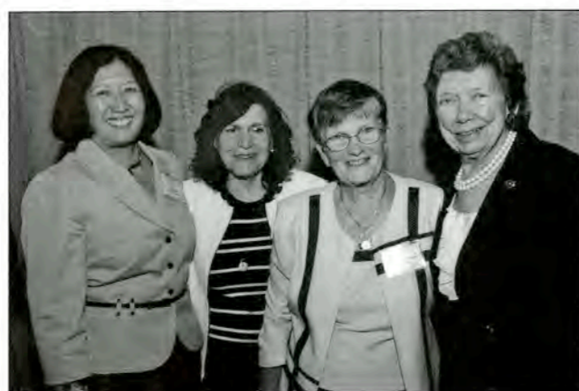
Present and Past Presidents