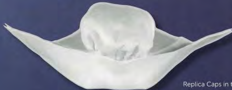
Replica Caps in the office

Non-Profit Org. US Postage PAID Permit #276 Philadelphia, PA