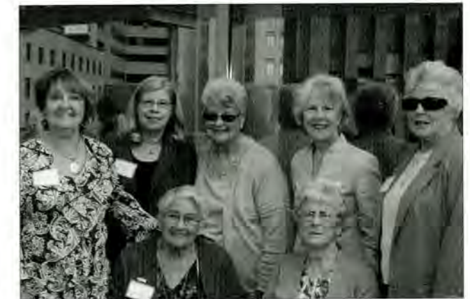
Central Pennsylvania Satellite