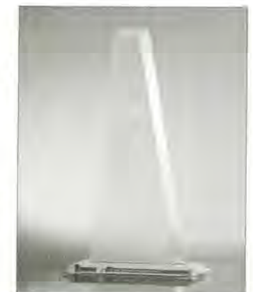
The Miss Janet C. Hindson Award