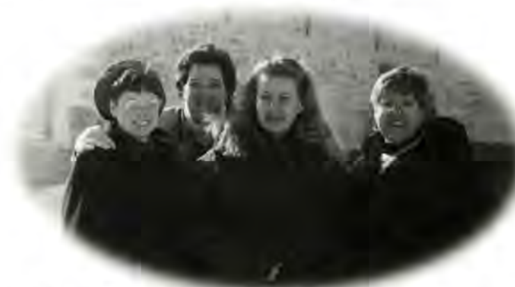
March, 1998 Leadership/Management Workshop, Tihuta, Romania; Outside Hotel Castle Dracula

While funding for the project has expired, it is our hope that AIHA will continue to fund nursing endeavors between the Jefferson and Romanian Nursing Teams.