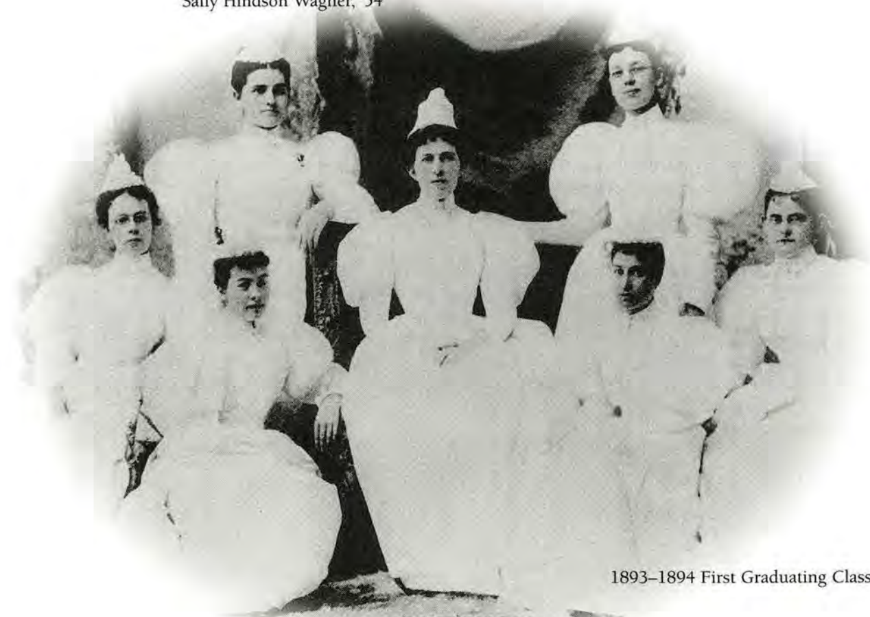
1893-1894 First Graduating Class