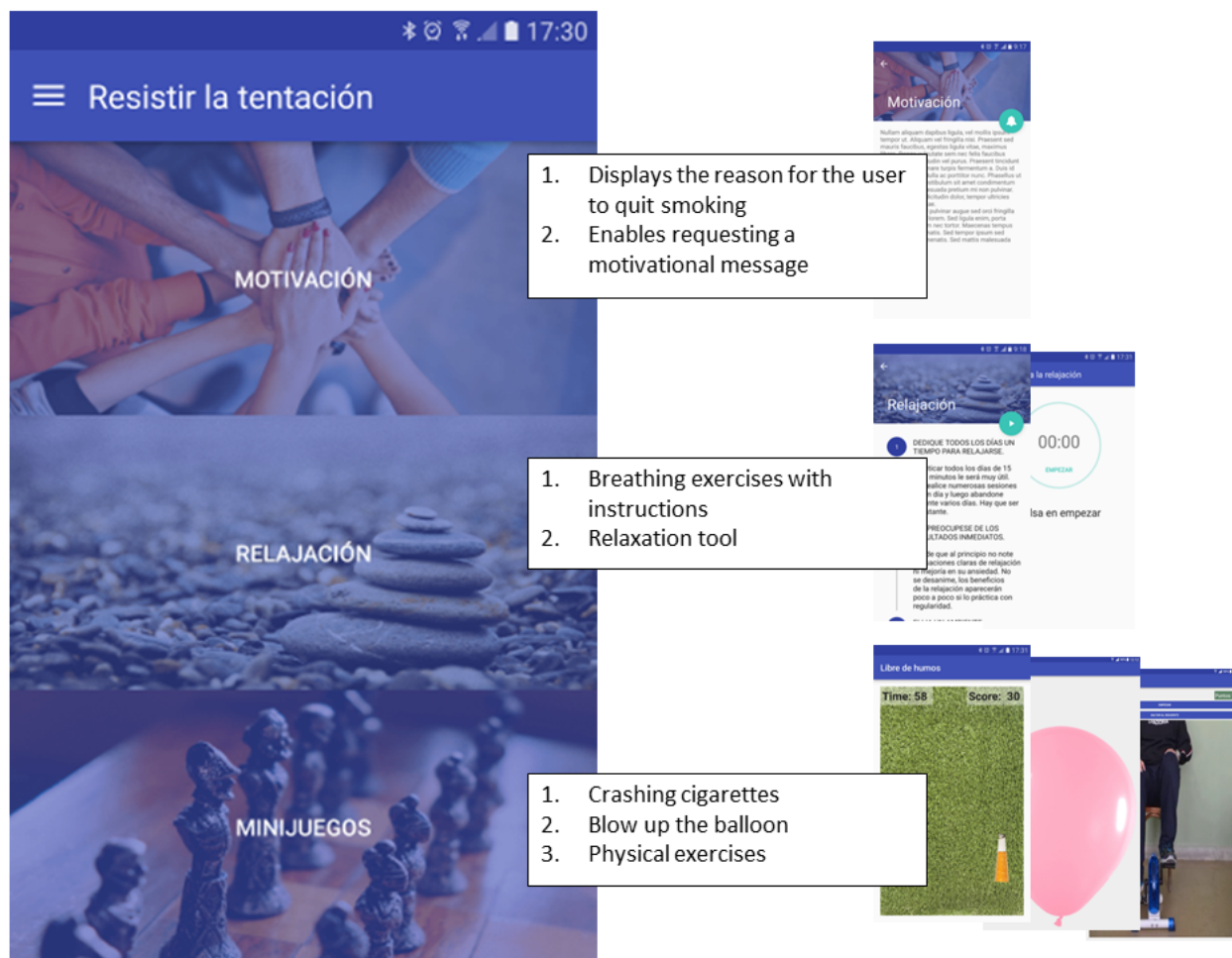
Figure 1. Sections of the app that address how to resist cravings.

To assess efficacy, the main clinical outcome will be the smoking abstinence rate at 1 year measured by means of exhaled carbon monoxide and urine cotinine tests.