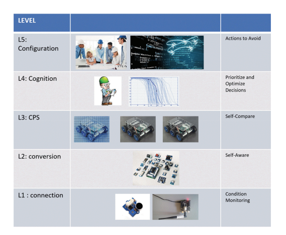
Figure 3. 5c architecture overview examples (Lee et al.).