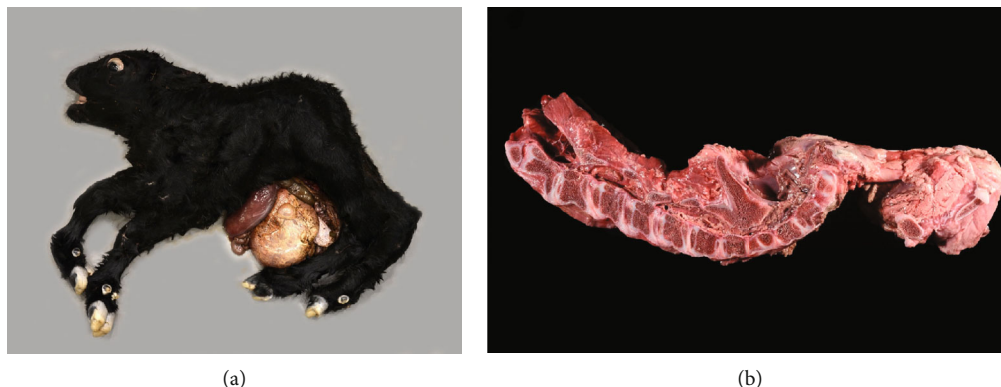
FIGURE 1: Gross necropsy photos of the stillborn male Angus calf with appreciable congenital deformities: short and rounded skull, maxillary brachygnathism, arthrogryposis, vertebral aplasia, and abdominal organ herniation (a). A longitudinal section of the spine in right lateral orientation (b) highlights agenesis of the lumbosacral and caudal vertebra and spinal cord agenesis abnormalities as are characteristic of perosomus elumbis.

and transrectal palpation examinations (especially positioning of the broad ligaments, uterus, and fetus), the cow was diagnosed with an approximately 360° left (counterclockwise from the rear of the animal) uterine torsion.