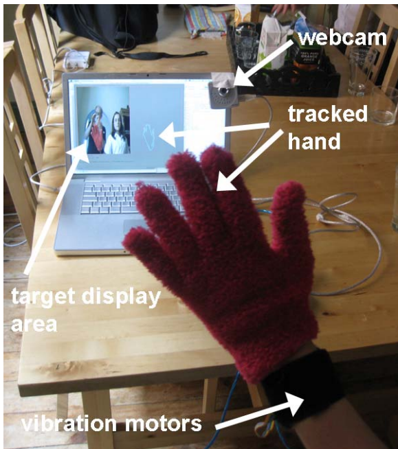
Figure 4. The experimental set up for testing whether two vibration motors could guide arm movements in one and two dimensions. The subject wears a coloured glove on their moving hand that is tracked using a webcam and computer vision software. Subjects position their hand at a central starting point on the display area and then have to move their hand as quickly as possible to a target location. In some conditions the target position is shown with a brief visual cue. Vibrotactile feedback from two vibration motors provides information about the hand's proximity to the target in some of the test conditions.

In the one dimensional task there were no significant differences between the three conditions in the accuracy of the subjects' movements to the targets (repeated measures ANOVA F(2,16) = 0.38, p > 0.05 ). A significant effect of time was found ( F(2,16) = 15.88, p < 0.0001 ). Pairwise comparisons indicated that the vibrotactile only condition took longer to complete than both the visual ( p < 0.05 ) and visual + vibrotactile conditions ( p < 0.05 ). This is explained by the fact that in the visual only and visual + vibrotactile conditions, subjects perform an initial ballistic movement whereas in the tactile only condition it is a closed loop behaviour where subjects continuously adjust their movement on the basis of the vibrotactile feedback.