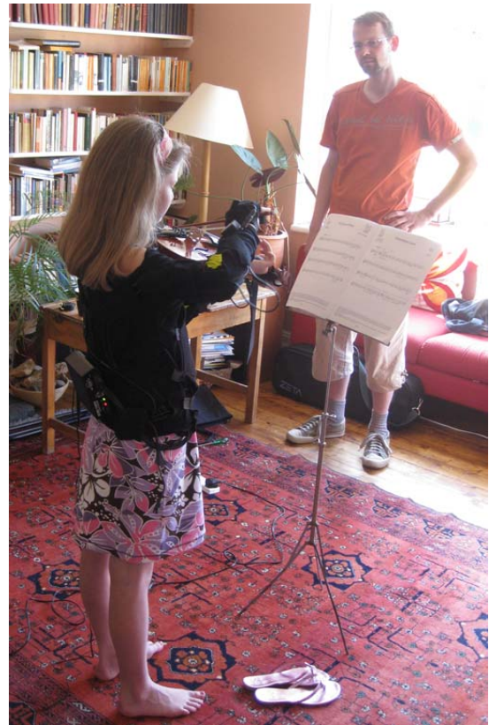
Figure 1. Tracking the bowing action of a young violin player who is wearing the Animazoo IGS-90-M motion tracking system. The movement of her bowing arm and the position of the violin are tracked using 6 inertial measurement units. The motion capture data are transmitted wirelessly to a laptop.

The development of motion capture techniques in the last decade offer new possibilities for the study of bowed-string instrument performance. A variety of systems have been successfully used to measure bowing gestures, based on sensors, motion capture techniques (optical, as well as magnetic field tracking) or combinations of the two [4-7].