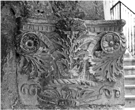
4. Kotor, Drago Palace, corbel under the passage vault.