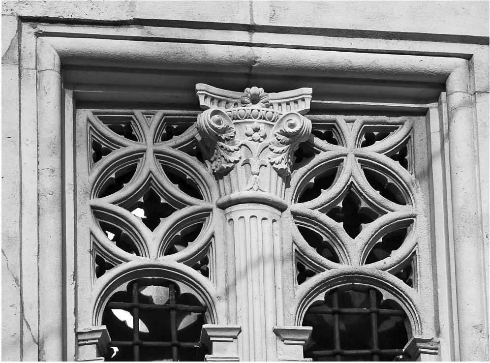
2. Šibenik, St James' Cathedral, main apse windows (1468–1473), detail.

softly modelled acanthus leaf with deep pipe-like dents and sharply serrated almond-shaped fringes, according to M. Gosebruch connected with Michelozzo's capitals, 8 and the palmette motif with bean-like sprouts (Gk. anthemion , It. lupiniere ), enabled the recognition of the second Renaissance layer of the chancel datable in the last years of Giorgio's supervision of the building. Apart from the pair of large capitals of the eastern pillars of the crossing and the corresponding decorative inserts on apse junctions, the stylistically purest Renaissance realization of the entire Giorgio's building phase was realized during this final period (1465–1473) – a series of five large rectangular paired windows forming a row on the main apse (figs. 1, 2). Structural maturity, good proportioning and consistent use of Early-Renaissance morphology pertinent to the capitals of slender fluted columns reveal not only the skilled application of the latest decorative repertoire, but also the knowledge of contemporary theoretical principles and corresponding aesthetic categories such as the diversity of new forms ( varietas ). 9 Combined with a certain dynamics and elasticity pertaining more to metal