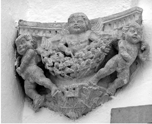
6. Dubrovnik, Church of St Dominic, sacristy, St Vincent's chapel (1470–1474).