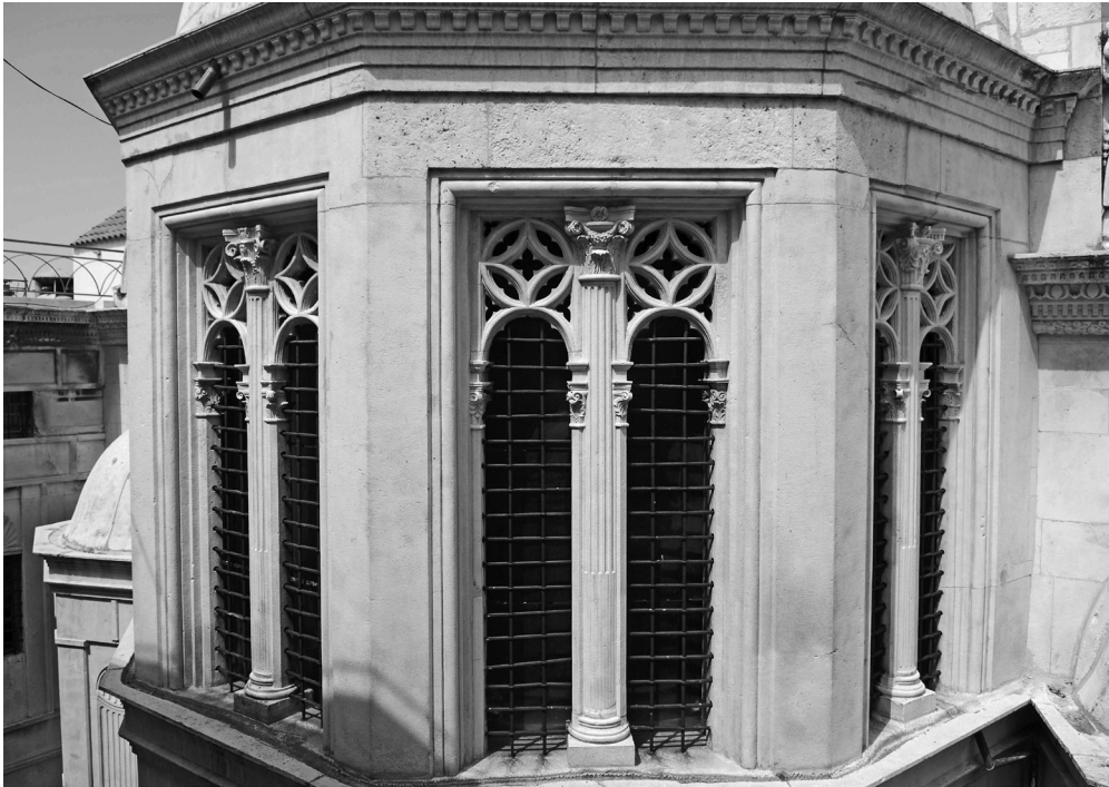
1. Šibenik, St James' Cathedral, main apse windows (1468–1473).

decades of research and study of this fairly brief but significant Dubrovnik episode of the activity of Florentine masters on the eastern coast of the Adriatic. 3