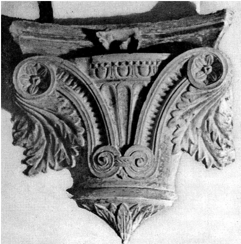
5. Urbino, Ducal Palace, Appartamento della Jole, vault corbel.