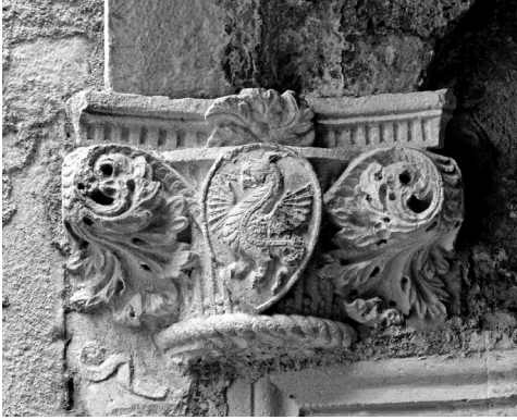
3. Kotor, Drago Palace, corbel under the passage vault.