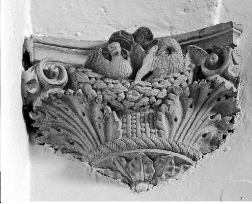
7. Dubrovnik, Church of St Dominic, sacristy, St Vincent's chapel (1470–1474).