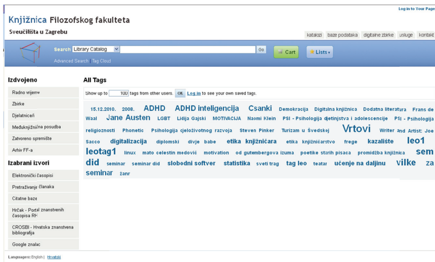
Image 1. Overview of the tag clouds in the catalogue of the Faculty of Humanities and Social Sciences Library

Unfortunately, the Library itself does not use controlled vocabularies for the subject indexing. Only uncontrolled index terms are used for subject analysis of the library's collections by the librarians/subject experts.