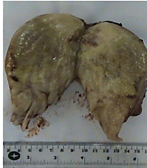
Figure 3. Surgical specimen, the mass was 9 x 8 x 5 cm in size, solid, multi lobes, cut surface showed white and homogenous.

Diagnosis after surgery was post medial parotidectomy on indication right parotid pleomorphic adenoma involving PPS. Evaluation after surgery, there were no active bleeding, no facial nerve paresis. On laboratory examination was found haemoglobin 12,3 gr/dl. The patient was given therapy ceftriaxone 2 x 1 gr IV, tramadol 50 mg drip in 500 ml Ringer Lactat. Suggested soft meal diet.