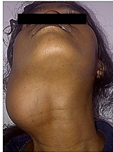
Figure 1. On physical examination of right parotid to neck region was found mass with 11 x 10 x 6 cm in size.

Working diagnosis was suspicious benign right parotid gland tumor with IX,X,XII nerves paresis. Differential diagnosis were benign thyroid tumor, peripher neurogenic tumor, and paraganglioma carotid body. Planned to perform Fine Needle Aspiration Biopsy (FNAB), Computed Tomography (CT scan) of neck region, thyroid function laboratory examination (T3, T4, TSH), thorax x-ray and angiography.