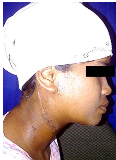
Figure 4. On day seven after surgery.

Two weeks after surgery, there was no complaint. On physical examination there was no swelling at the neck, no sweating while chewing. On telelaryngoscopy examination was found larynx pushing to medial minimal