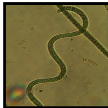
Figure 1. Morphology of Spirulina sp (400x magnification)

Figure 1 showed the morphology of Spirulina sp. This green alga is a cyanobacterium with spiral form [11]. Cultivation of Spirulina sp was kept for 2 weeks under fluorescent lamps in Laboratory to obtain 1 g of dry biomass. In this research, we attempt to see the relationship of medium cultivation of Spirulina sp with their chemical composition in order to utilize Spirulina sp as adsorbent of metal ions.