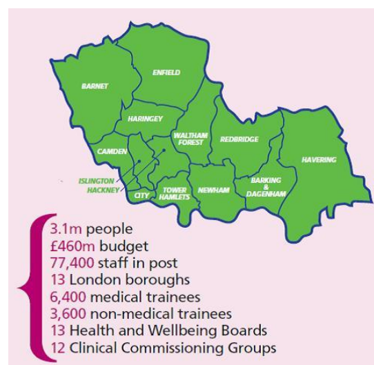
Figure 1.3: The HE NCEL geographical area

The HE NCEL geographical area is large and encompasses a population of 3.1 million people from a range of socio economic statuses; there is expected to be a growth of 21% in the population of those under 15 years of age by 2021 (HE NCEL, 2013b), this reinforces the need to consider the educational needs of the workforce who will be meeting the health needs of this sector in relation to out of hospital services.