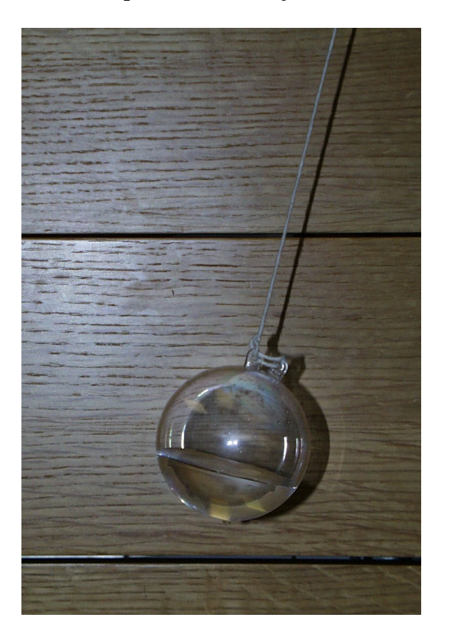
Figure 1 : The water level in an oscillating pendulum

One of the nice benefits of these 'kitchen sink' experiments is that the students tend to look on them as open fresh territory. We suggest a contrast with a traditional physics experiment that has attached to it a very concrete outcome. Students are honed in to those observables that lead them to the answer. They are accordingly less likely to observe the general nature of the phenomenon in hand. A nice example to illustrate this uses the acrylic sphere again. Partially filled with water, the sphere is suspended from a wound rubber band and released. The rise of the fluid surface up the sphere is impressive, and students can watch to see how the fluid surface changes shape and note the propagation of small surface waves as the spin speed and direction change during the oscillation. So we find that investigating the effects of changing rotation, and the unusual shape of the vessel, can give renewed life to the classical problem of a cylinder of fluid in uniform rotation.