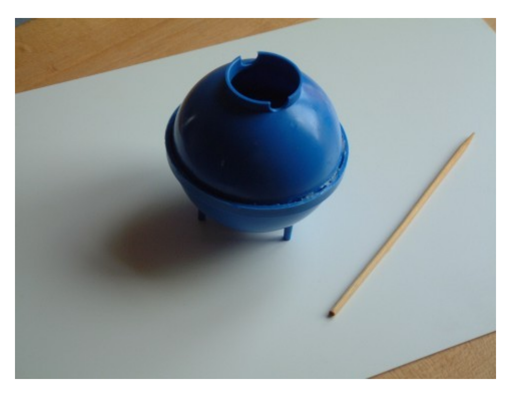
Figure 2 (below): The wax candle mould (separated into two hemispheres to show the small drainage hole)