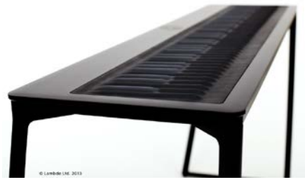
Fig. 6 The Seaboard designed by Sea Labs.

Another venture that was part of the Design London incubator was Sea Labs, founded by Roland Lamb. SEA stands for Sensory, Elastic and Adaptive. The SEA Interface is a novel touch sensory system that can be moulded into various shapes, and enables the seamless transition between discrete and continuous input. It is capable of capturing three-dimensional gestures and gives the user a tactile feedback. Lamb entered the Design London Incubator in early 2011 with his first product, the Seaboard, a radically new musical