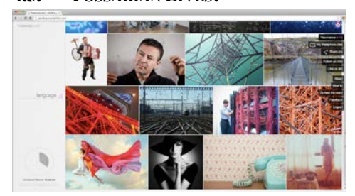
Fig. 7 The Yossarian Lives! user interface generated in response to the search term "language"

Yossarian Lives! is a more recent ventures and a current members of the InnovationRCA Incubator. It differs from all the others in that it is surrounding a software product. Yossarian Lives! is a metaphorical search engine that uses algorhythms to generate results, which are not literally, but metaphorically linked to the search terms. Thus Yossarian Lives! assists users as a creative tool, capable of generating unexpected results, that trigger new thought processes within people's minds. Due to the fact that the product is purely digital, it is impossible to patent in Europe. Instead the inventors, a team of three, J. Paul Neeley, Dan Foster-Smith and Katia Shutova, rely on secrecy in order to sustain exclusivity on the market. Key elements in the programming code are not shared. The search engine, the name of which is a reference to the main character in the novel Catch 22, is currently