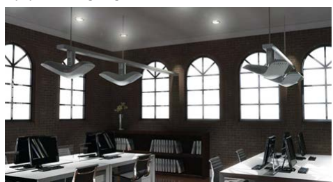
Fig. 5 Arctica cooling system