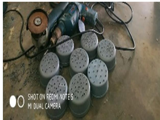
Figure 4. The Process of Making Pipe Covers for Water Infiltration

From the results of the study Victorianto, Qomariyah, & Sobriyah, 2014 it was found that the biopore hole was used to absorb rainwater and store it in the soil so that it could overcome the dry soil conditions during the dry season. Therefore the KKN-PPM team makes water containment (boipore hole) in Blaban village to overcome the drought.