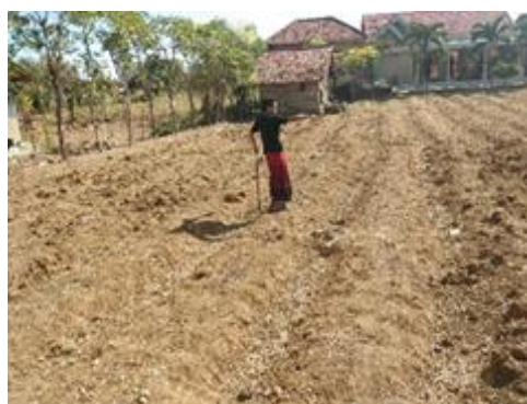
Figure 1. Condition of soil structure in Blaban Village

Satya Lencana Wirakaya Agriculture in 2011. The most important agricultural commodities in Pamekasan Regency include food crops and horticulture.