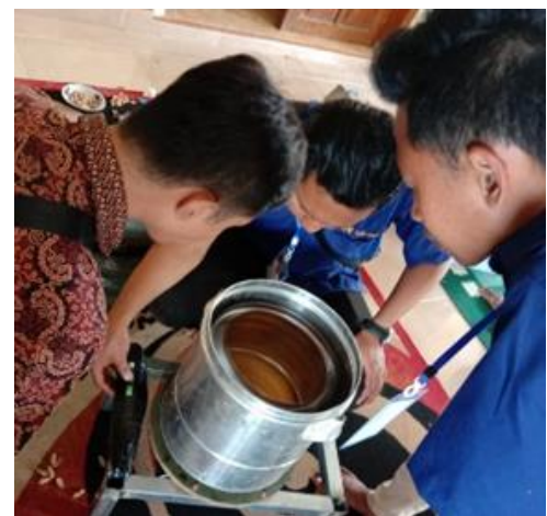
Figure 9. Socialization of The Spinner Machine

Fourth, socializing the Spinner machine by using tools from the KKN-PPM team (Figure 9), Blaban villagers were very enthusiastic in following the purple uwi chips drainage training activity using this spinner machine.