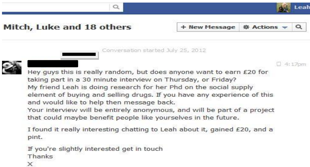
Figure 1: Social Media Recruitment

The advertisement of the research to a large group of friends via social media (Facebook), proved to be instrumental. As portrayed above (fig 1), the gatekeeper's advertisement, which described how he participated and also benefitted from the research, was not only successful in recruiting the remainder of the sample (n=20) in phase two of the fieldwork, but also in obtaining a group of individuals who were well integrated in the social supply scene and eager to participate in the research. In line with my research aims, the combination of phase one and two of the fieldwork produced 30 social supply interviews, of which 86% (n=26) of the sample were male, and 14% (n=4) female.