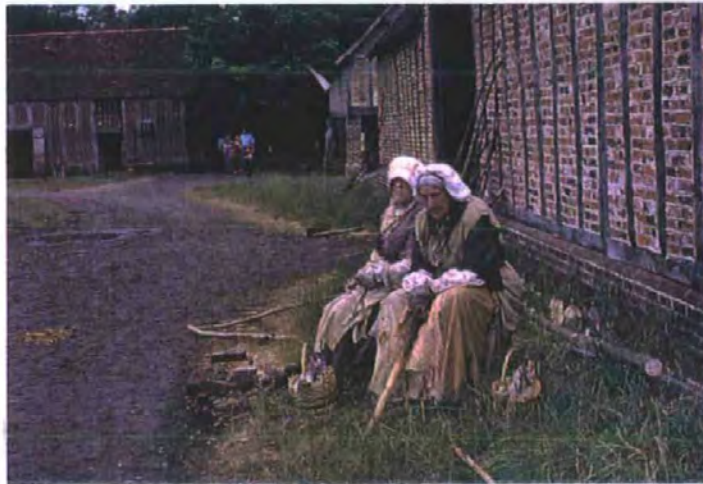
Fig. 21 Interpreting social issues close to home in an historic context. The 'hags' at Kentwell Hall have faced strong reactions from children. (stone-throwing).