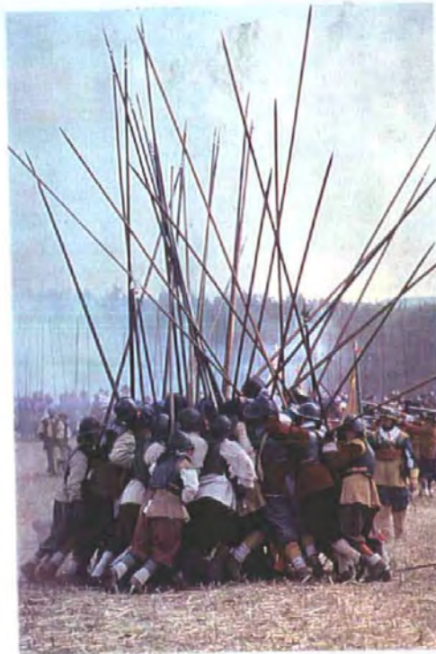
Fig. 18 Whether to fight at 'push' or 'point' is a recurring debate on the letters page of the Orders of the Day .