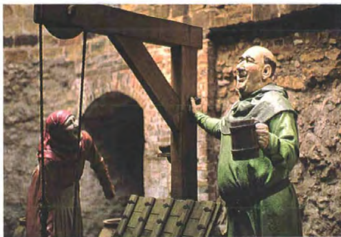
Fig. 11 Durable models at Tonbridge.