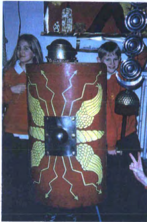
Fig. 13 Trying on costume gets children excited, so the interpreter must remain focused on the message. Buddle Lane Middle School, Exeter.