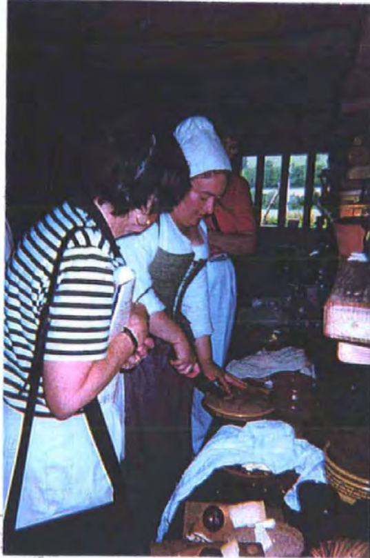
Fig. 12 Can the author talk with the visitors and get the dinner on the table on time?