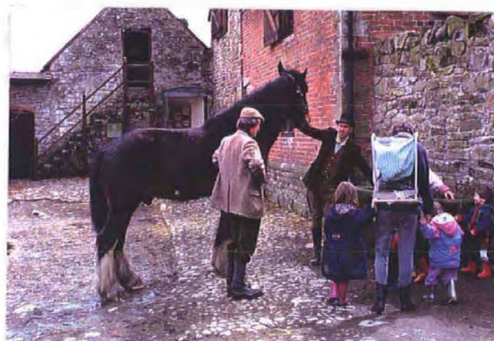
Fig. 2 Acton Scott Historic Working Farm