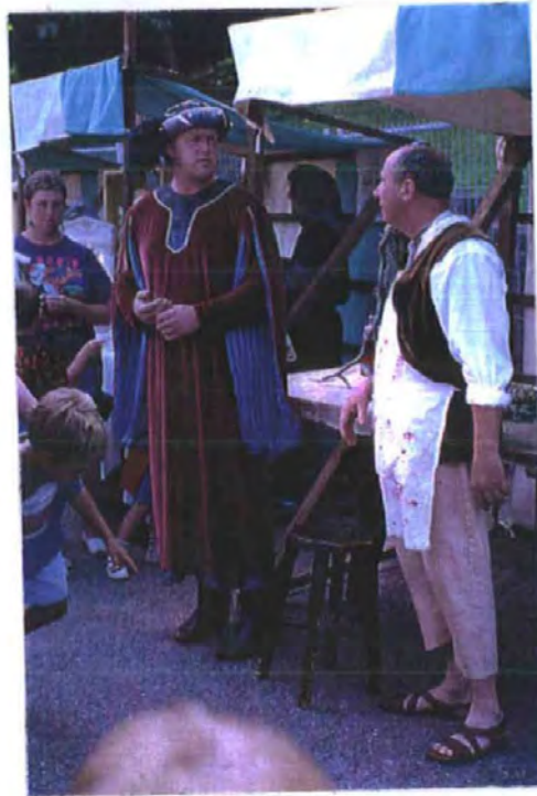
Fig. 4 Medieval street theatre with Extra Bodies.