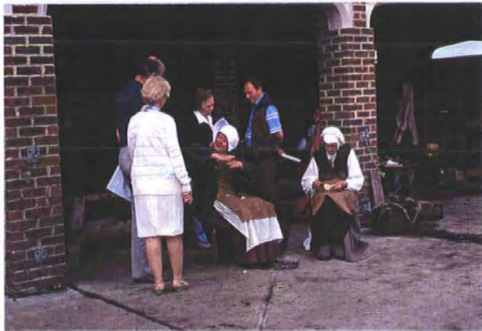
Fig. 6 Being aware of visitor's body language is essential. Kentwell Hall.