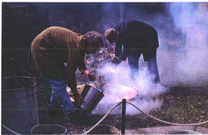
Fig. 15 The wheelwright at Acton Scott preserving traditional crafts.