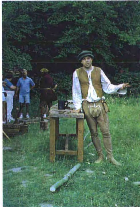
Fig. 17 Placing the emphasis on the visitor experience. History Re-enactment Workshop at the Weald and Downland Museum.