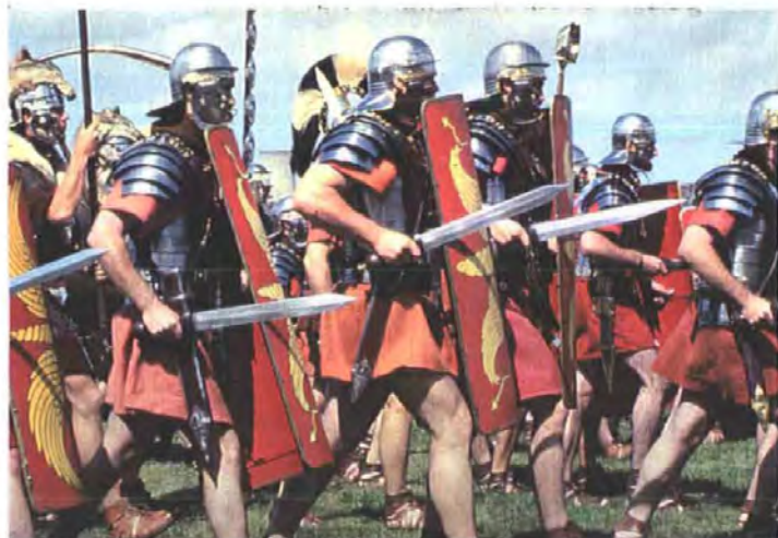
Fig. 20 The Ermine Street Guard favour demonstrations to battle re-enactment.