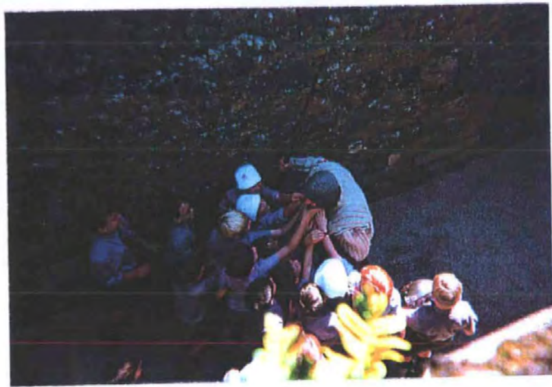
Fig. 7 A hands-on experience for school children, and Ian Skipper at Castle Cornet, Guernsey. Echoes from the Past.