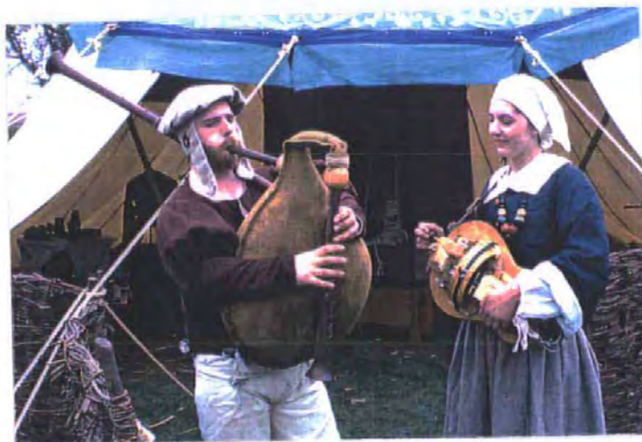
Fig. 3 Hautbois: more than just good music.