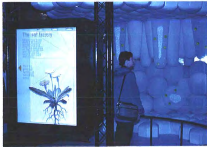
Fig. 5 Once a major exhibition is in place, it becomes inflexible. Natural History Museum.