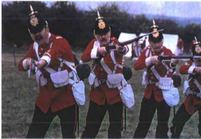
Fig. 22 Could interpretation training be undertaken as part of drill? Die Hards.