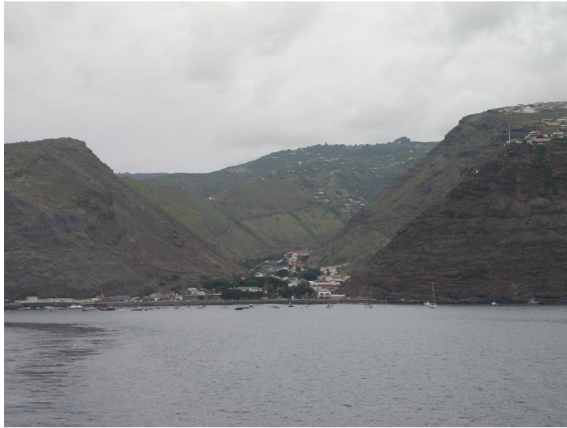
Plate 1.0: St Helena’s capital Jamestown nestles in a steep valley between barren cliffs.

Another interviewee described the island as having “nothing but vast amounts of British aid” (Interview, UK, 25, 2011). St Helena has few natural resources. Steep volcanic cliffs surround the Island and render more than fifty percent of the island unsuitable for agriculture (St Helena Government, 2010).