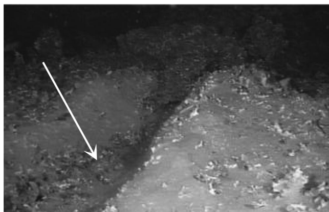
Figure 2. Trawled L. pertusa grounds at a depth of 200 m in the Iverryggen area, West Norway, May 1999. Smashed coral fragments litter the sediment around a clear trench from towed fishing gear (arrow). Lower edge of photograph ca. 1.5 m.