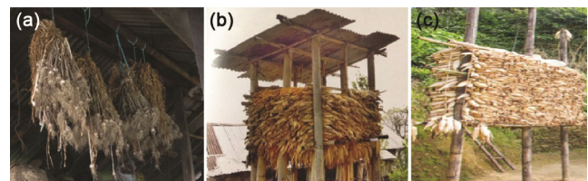
Fig. 5 — Jhutta

In case of dhikuti , before and after placing seeds, the structure is fumigated with smoke of dry chilli burned in coal. The reason for doing the same as informed by informants is to scare away any bad spirits as well as the grains or seeds are not attacked by rodents and pests following fumigation. It is felt that the pungent and strong fumes of chilli might mimic the action of fumigation thus the seed or grains are not damaged by rodents. Birds' eggs were placed on the top of the grains to scare rodents from the place. Respondents told that the rat assumes it as snake eggs as an indication of