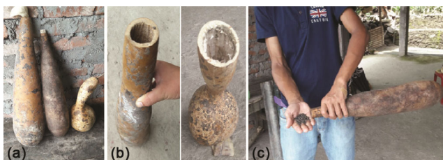
Fig. 4 — Seeds stored inside mature and dry shell of bottlegourd

Dalo: Dalo is a small conical or circular shaped basket made out of bamboo (Fig. 6). The bamboo is thickly woven to ensure that grains remains intact inside it. Unlike Bhakari and Kotha/Kothe , it doesn't require any plaster or mud/cow dung lining. Dalo is commonly found and used in every household of Sikkim. It has the capacity of holding about 10–15 kg