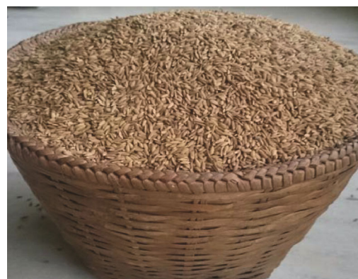
Fig. 6 — Dalo