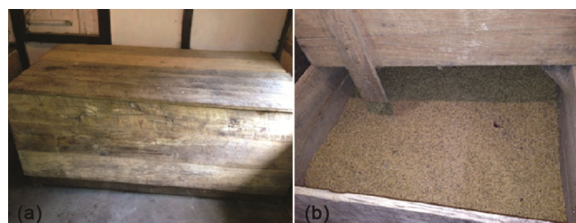
Fig. 1 — Dhikuti; closed (A), open (B)

Bhakari: A woven bamboo mat rolled into a cylinder and placed on one end, on a mat (Fig. 2). The base consists of rice straw smeared with cow dung. Bhakari may be large, medium or small depending upon the quantity of the grains to be stored. They may or may not have lids made of straw. They are plastered with cow dung or mud, which not only