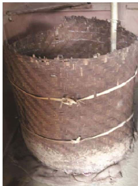
Fig. 2 — Bhakari

Chindo: Chindo is another indigenous practice of small storage in Sikkim, wherein the seeds are stored