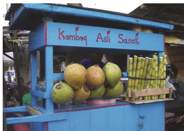
Fig. 6 — Cocos nucifera fruit

In addition to teh gaharu , Gyrinops versteegii also can produce other types of drinks, such as kopi gaharu