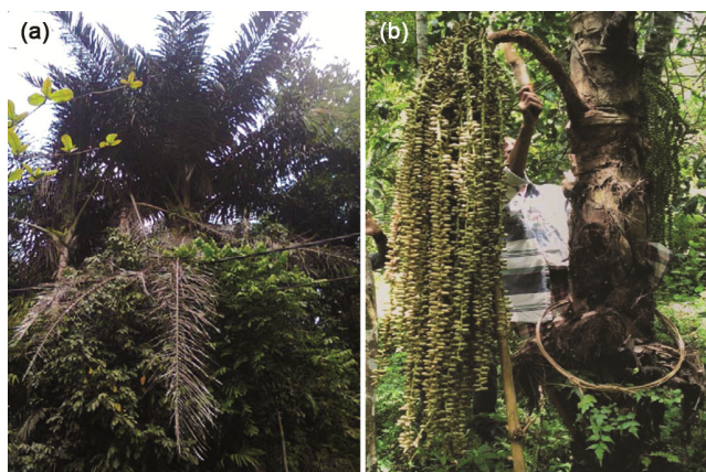
Fig. 5 — (a) Arenga pinnata tree, (b) Arenga pinnata peduncle

The results of nutritional data conversion based on Indonesian Food Consumption Table 2005 showed that sweet palm wine was superior in terms of energy content, whereas in biplot analysis tuak toaq were grouped together with the beverages characterized by protein and phosphorus 5 .