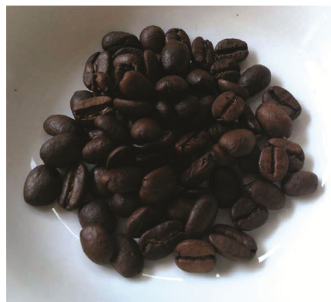
Fig. 1 — Coffea sp. bean

Kopi kedele or soya coffee is a steeping drink from roasted soybeans (Fig. 2), as is the case for preparing coffee drinks ( Coffea sp.). Soya coffee is generally consumed as a substitute coffee, for people who cannot consume Coffea sp. for health reasons.