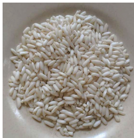
Fig. 4 — Oryza sativa var. glutinosa

Lombok brem resembles brem from Bali Island, which is a liquid product containing alcohol, reduction sugar, CO 2 gas and a little organic acid. Brem is yielded from a reaction between carbohydrates with enzyme and water to produce sugar. The sugar then reacts again with the enzyme to produce alcohol and CO 2 gas. Brem is generally consumed after eating. It generally tastes sour and sweet, red in colour, with an alcohol content of 3-10% 3 , and can be produced from black or white sticky rice. The first stage of fermentation produces sticky rice