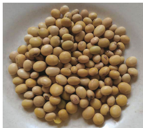
Fig. 2 — Glycyne max bean