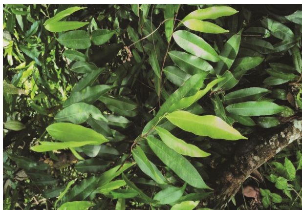
Fig. 7 — Gyrinops versteegii leaves

or agarwood coffee, produced from seeds that are dried, roasted, mashed and then brewed like normal coffee. It was informed by local people that agarwood coffee is efficacious to make people stay young. Other type of health drink is biosol , which is obtained from the distillation of oil from the agarwood stem. Biosol is a solution found below the oil. The benefits of these agarwood drinks are thought to be related to the phytochemical compounds in agarwood plants. Agarwood coffee and biosol have not been widely used by the community, but agarwood tea is sometimes used to treat fatigue or cold. This tradition is mainly found in the agarwood cultivation area, such as South Orong Village, West Lombok Regency.