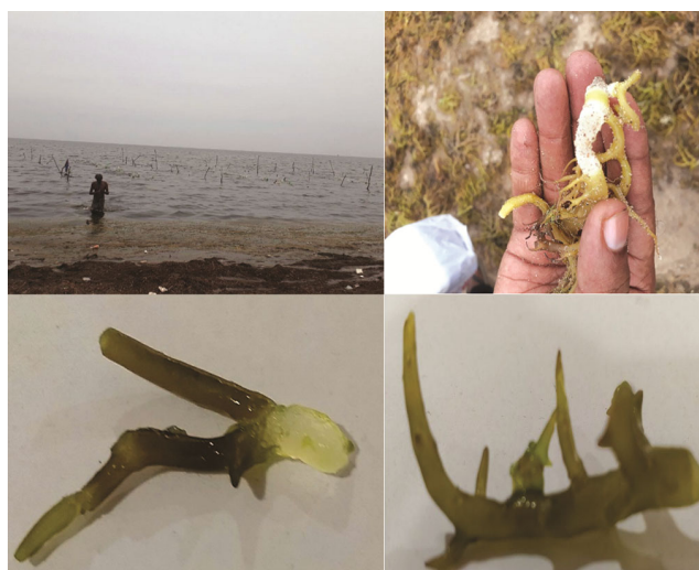
Fig. 1 — Collection of K. alvarezii sample from sampling site (A); (B & C) Ice-Ice disease infected K. alvarezii (B & C); Healthy sample of K. alvarezii (D).

The ice-ice disease infected K. alvarezii is shown in Fig. 1. Growth of white milky bacterial colonies is observed in RMZMA01, THZMA01, KTZMA01-Zobell Marine Agar plates (Fig. 2a) and yellow colonies in TCBS plates of RMTCBS01 and THTCBS01 plates, but no colonies are observed in