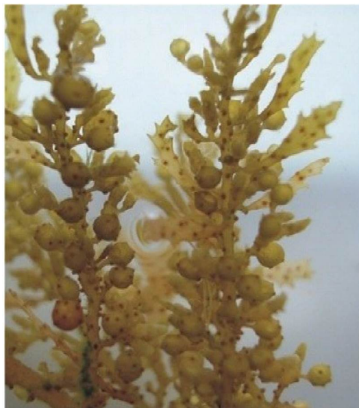
Fig. 1 — Sargassum polycystum C. Agardh

The brown seaweed Sargassum polycystum C. Agardh was collected from Harbor beach, Tuticorin, Tamil Nadu, India (Fig. 1). The collections were made during the low tidal and sub-tidal regions (up to 1 m depth) by hand picking of seaweed. The collected materials were washed with marine water thoroughly in the field to remove the adhered epiphytes and sediment particles. The cleaned samples were packed separately in polythene bags in wet conditions and brought to the laboratory. The seaweed samples were further washed in tap water to remove salt particles followed by distilled water. The samples were dried (shade) for 15 days at room temperature. The dried samples were chopped into fine fragments with the help of a mixer. The powder samples were stored in refrigerator for further use.