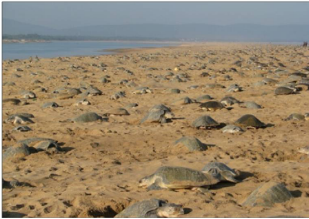
Figure. 1 — Turtle mass nesting at Rushikulya rookery