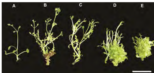
Fig. 2— In vitro propagation of Stachys annua . Shoot proliferation after 4 weeks; (A) on culture medium from nodal explant on free MS medium (control). (B) on culture medium from nodal explant on MS medium supplemented with 2.0/0.1 mg/L 2iP/IBA. (C) with 2.0/0.1 mg/L KIN/IBA. (D) with 2.0/0.1 mg/L 6-BA/IBA. (E) with 2.0/0.1 mg/L TDZ/IBA. Bar = 1.28 cm

found in sample 5, low in sample 1, 3 and 4, whereas sample 2 was comparable with that of natural sample, which contained highest amount (18.08 mg/100 gm). The highest Caffeic acid was found with 34.51 \pm 2 in sample 3. Vanillic acid was not found in sample 1, 4 and low amounts in sample 2 and 5 whilst control and natural sample possess high amount. Epicatechin was found to be highest in sample 3. Ferulic acid was found to be highest in sample 1, 2 and 5 while low in natural sample as well as sample 3 and sample 5. o -Coumaric acid was found only in two samples (i.e. control and sample 4). Quercetin was highest in