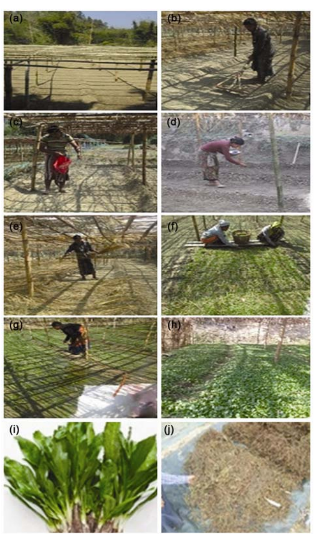
Fig. 2—Different stages of spiny coriander cultivation; a. shade house and land preparation, b. leveling, c. fertilization, d. seed broadcasting, e. mulching, f. mulch removed after germination, and weeding, g. irrigation, and h. growing spiny coriander, i. harvested coriander, and j. drying of matured coriander

In this study a total of 68 % of those interviewed reported symptoms which they described as leaf