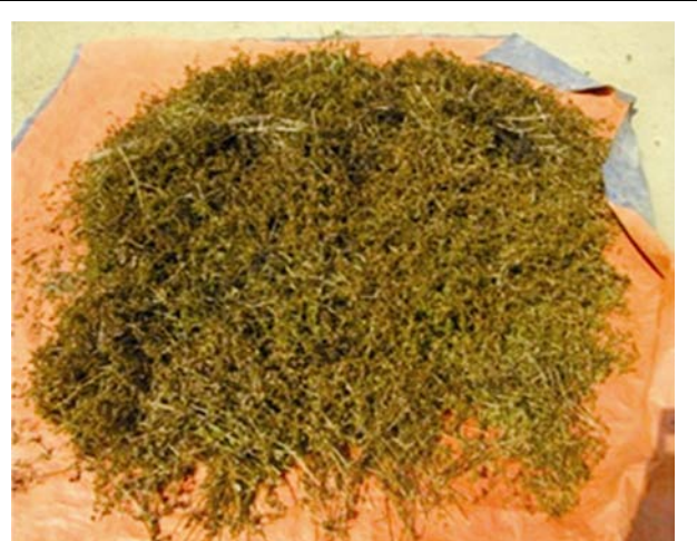
Fig. 1-Drying of harvested spiny coriander plant for seed collection

subsequently undertaken (Fig. 2 and Table 2). A temporary structure (Fig. 2b) made of bamboo and wooden poles is placed over the plot to provide partial shade, this promotes vegetative growth<sup>16</sup> and suppresses weed growth. The soil is kept wet with regular irrigation as spiny coriander grows well in moist soil. When the monsoon starts in the month of May, there is generally little requirement for irrigation, but it is still needed occasionally. Weeding usually starts at 10-12 days after sowing and continues whenever necessary. Harvesting starts from April or May and continues up to October with a harvesting cycle of 20-25 days. In each cycle, an average of 740 kg coriander leaves can be harvested from 0.1 ha of land. Leaves are usually collected between 7 and 9 times from each plot. The leafy spiny coriander plants are uprooted, washed and bundled to sell in the market. After each harvest, Urea is applied as fertilizer at a rate of 120 kg/ha to stimulate the growth of the remaining plants. Insecticides and fungicides are also sprayed whenever necessary.