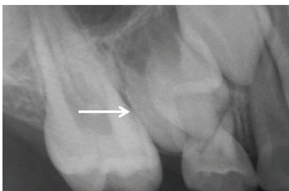
Figure 3. Intra-oral periapical radiograph showing conical shaped supernumerary tooth in premolar region

incisors in Asian populations. 4 It has also been reported that the unilateral form of dental agenesis was more common than the bilateral version. 4,14,15 Single mandibular central incisor in mandible has been reported and authors stated found the association with chromosome 18p. 16 Similarly, in the present case unilateral absence of central incisor was evident in both primary and permanent dentition. However, genetic analysis has not been taken place. Previous dental history is necessary to eliminate the possibility of extraction of a normal tooth before diagnosis of hypodontia. 17 In our case extraction of any tooth has not taken place, which was informed by parents. Contrarily, in present case two second premolars in maxillary arch and one mandibular incisor in mandibular arch were congenitally missing along with presence of conical shape supernumerary teeth in premolar region.